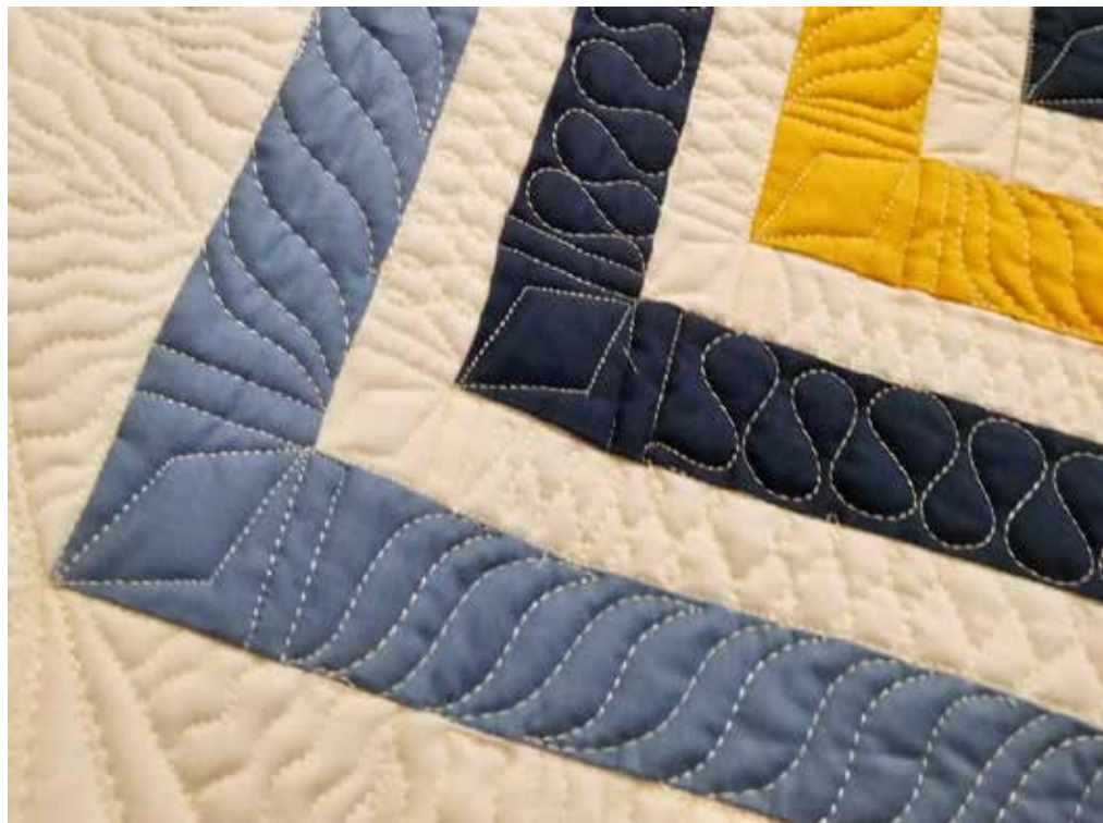
Try different designs in the border corner to create different looks for your quilts.