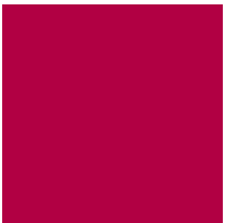
Blosson Glide (or a dark pink thread)