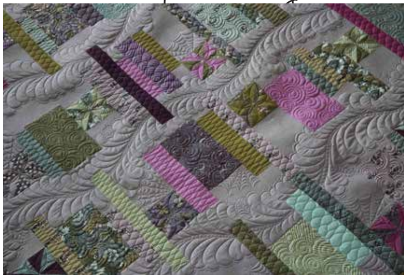
Spiked Punch by Tula Pink

Tula Pink wanted “creepy feathers” for her quilt, but with such irregular areas of background, the only option was to quilt “behind” the blocks.